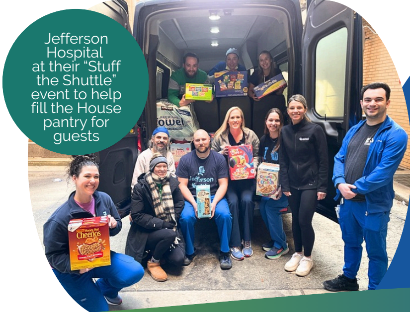
Jefferson Hospital at their "Stuff the Shuttle" event to help fill the House pantry for guests

As a registered 501(c)3 non-profit organization, Gift of Life Howie's House operates primarily on financial contributions from our community. We are grateful to our generous network of supporters that continue to fund our mission year over year.