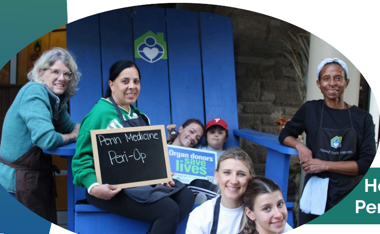
Hospital of the University of Pennsylvania Peri-Op Home Cook Hero team