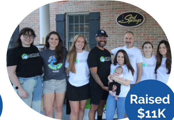
21 st Annual Kidney Open