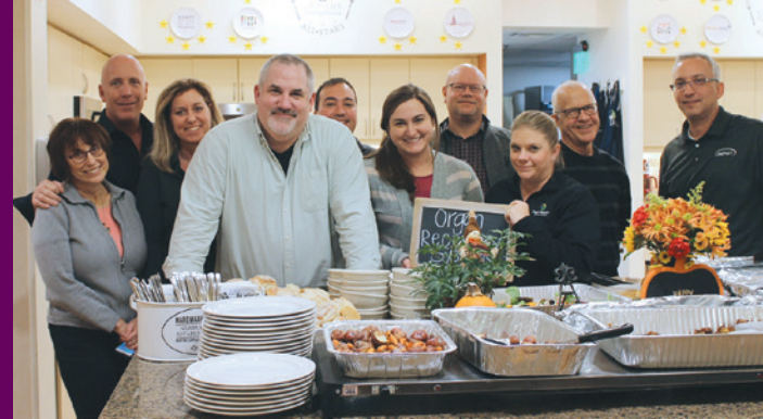
Team members from Organ Recovery Systems volunteering in the Family House kitchen

In 2011, ORS made a generous financial commitment to our mission by underwriting our kitchen – a capital campaign gift that helped us welcome transplant families home. Since then, many of their staff members have volunteered in our Home Cook Heroes Program to prepare home-cooked meals for our guests. ORS also generously supports our annual Kidney Open Golf Outing, which raises funds for our Adopt-A-Family Program.