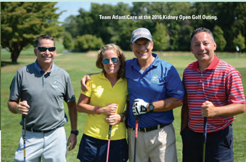
Team AtlantiCare at the 2016 Kidney Open Golf Outing.

The 13th Annual Kidney Open Golf Outing is just around the corner. You're invited to join us on Monday, August 28, 2017 for an exciting day of golf, networking and great food at the exclusive DuPont Country Club in Wilmington, Delaware. All proceeds will support the Adopt-A-Family Program at Gift of Life Family House! Sponsorship packages and golf spots are now available and registration is open. For more information, visit