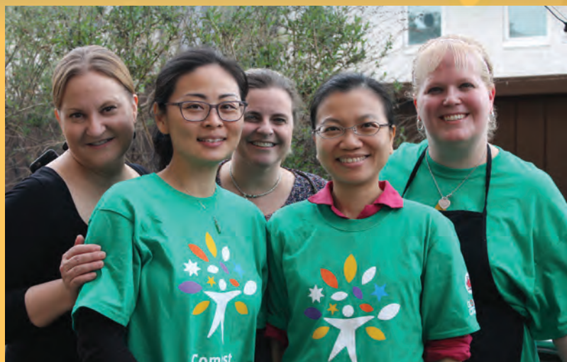
Volunteers from Comcast's Tax Accounting team.

We are thankful to the Comcast volunteers for their time, passion and dedication to the Gift of Life Family House mission!