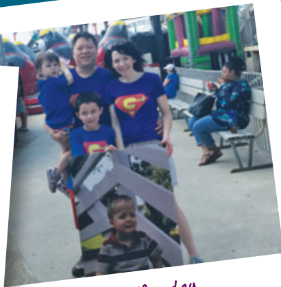
A Magical Monday