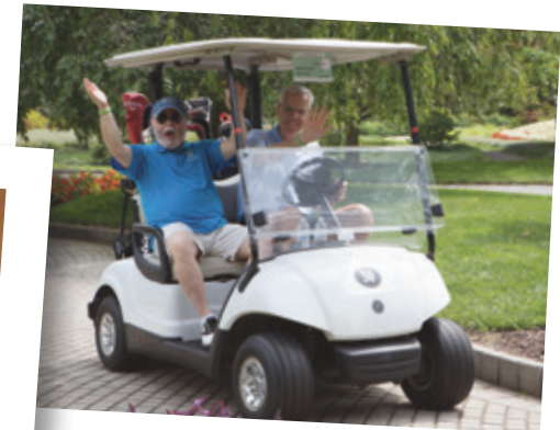
13th Annual Kidney Open Golf Outing

July 29 Volunteers, staff and guests gather for a special BBQ & Miniature Golf Celebration in honor of the 6th anniversary of Gift of Life Family House.