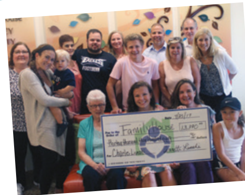
No Shower Happy Hour

July 17 The Bensalem Economic Development Corporation presents a check for $5,300 after hosting their 11th Annual Bensalem Township Charity Challenge in July. Several charities, including Gift of Life Family House, were supported through this event!