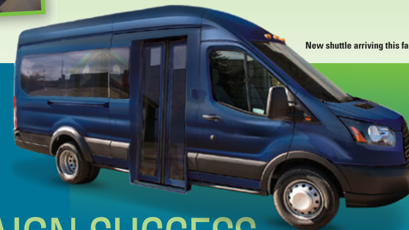
New shuttle arriving this fall.